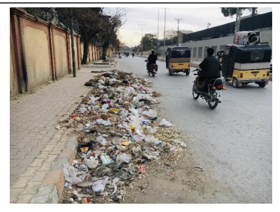
Pic 4. Waste lying on Inskumb Road