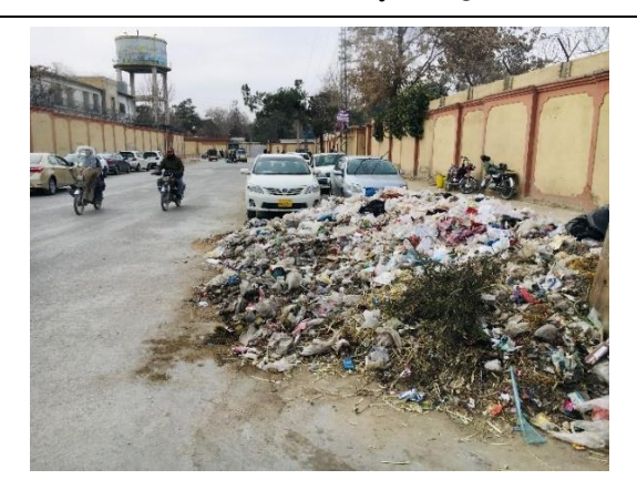
Pic 3. Waste Lying near Jinnah Road