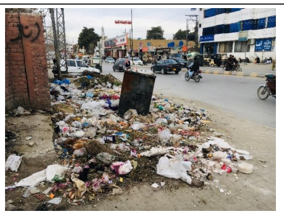
Pic 6. Waste collection point at Zarghoon Road