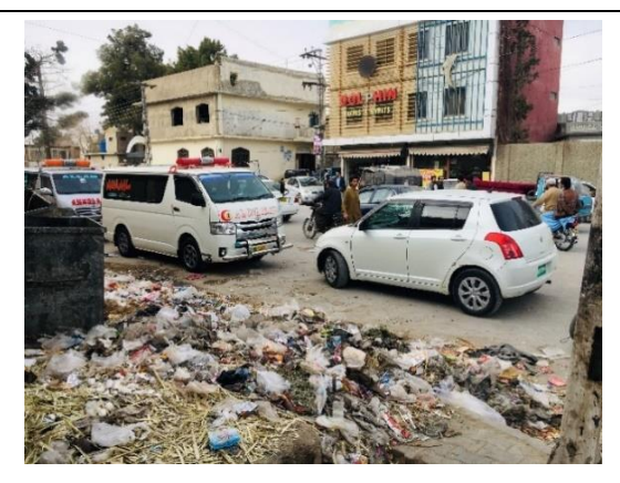
Pic 2. Waste lying on Sariab Road