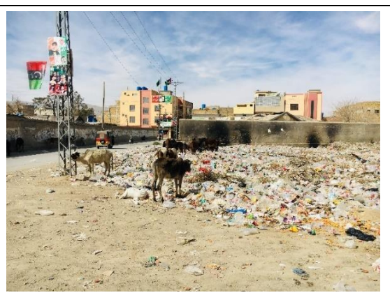
Pic 8. Waste lying near Railway Colony