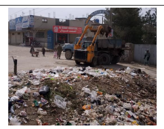
Pic 1. Waste collected by MCQ vehicle