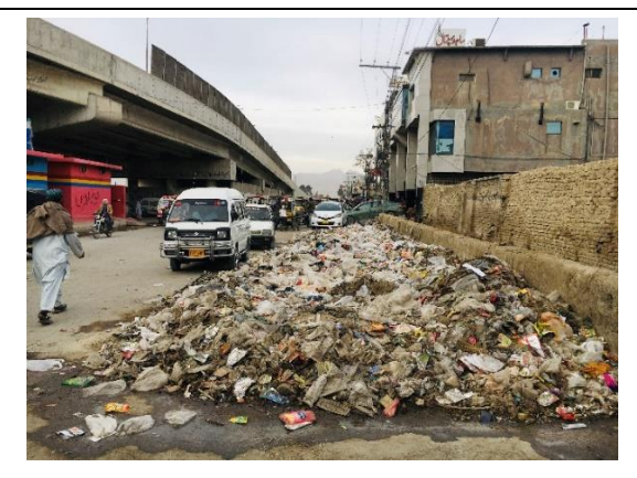
Pic 5. Waste laying near Akram Hospital