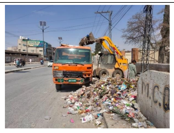
Pic 7. Waste collected at Sariab Road